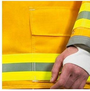
8" x 10" Semi Bellow Pockets on coat