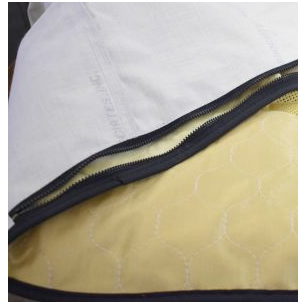
Inspection port On coat and pants.