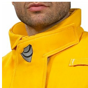
3" BR-1 Collar Patented BR-1™ collar – 3" – INNO5000™ Series – 4 layers (US Patent 6 481 018)