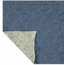
Thermal Barrier: Q-8™