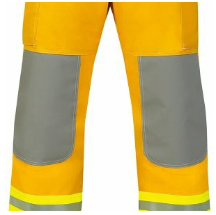
Regular Knees Knees reinforced with gray Polymer Coated Aramid.

Includes extra padding in the knee (14 oz Nomex® felt).