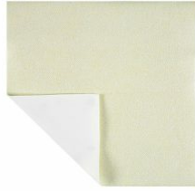
Moisture Barrier: Stedair® 3000