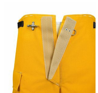
Hook & Dee closure on pants