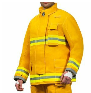
Brass Zipper closure on coat