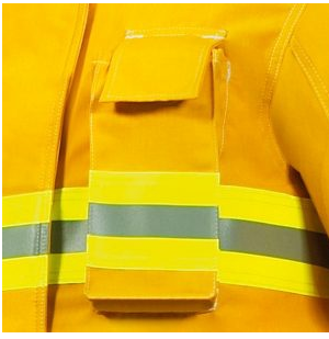
8" x 4" x 2" Radio pocket with mic loop Left Chest.