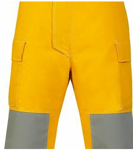
10" x 10" Semi Bellow Pockets on pants