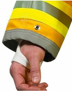
White Nomex wristlet with thumb hole