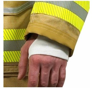
White Nomex wristlet with thumb hole