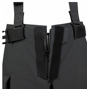
Vislon® Zipper Closure On coat and pants.