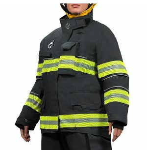
Basic Configuration 32" style coat / Regular waist pant

New York style Scotchlite® 3" Segmented (triple trim)