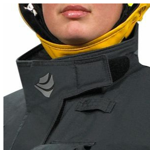
Variable Height Collar All-around protection with 4" back transitioning to 3" front.