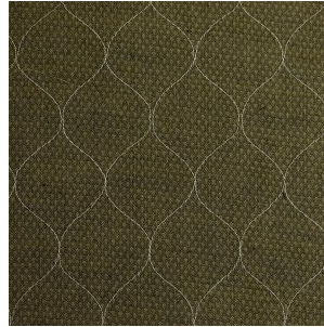
Thermal Barrier: Prism™ 2-layer