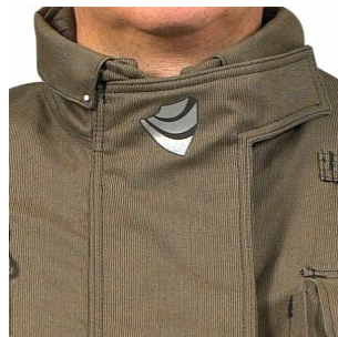
3" BR-1 Collar Patented BR-1™ collar – 3" – INNO5000™ Series – 4 layers (US Patent 6 481 018)