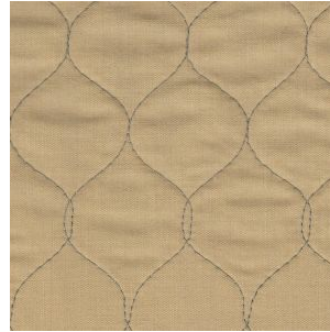
Thermal Barrier: Defender® M NP Brass