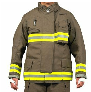
Basic Configuration 32" style coat / regular waist pant NFPA style 3M Scotchlite® 3" triple trim