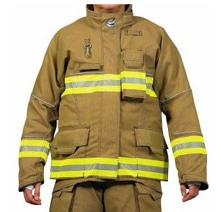
Flashlight Holder Right Chest.