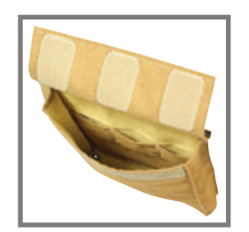
6-Tool - 2 rows of 3" wide tool compartments, 10" x 10" x 2" w/ Kevlar® reinforcement (aka Seattle)