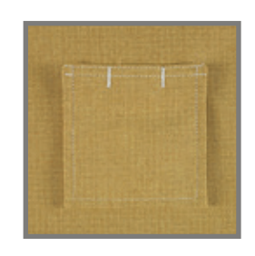
Extended flap with Hook & Loop fastener