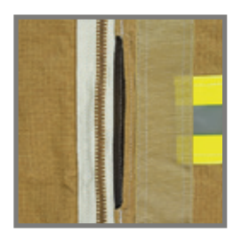
Napoleon pocket (5.5" opening on left side) (under storm flap) – with or w/o moisture barrier lining