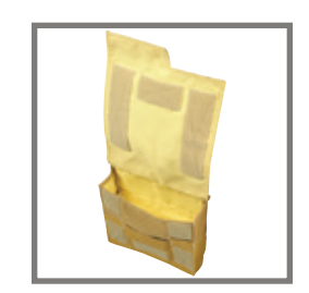
Self rescue pocket with Kevlar® and Polymer Coated Aramid (9" x 9" x 2½") (kit not included)