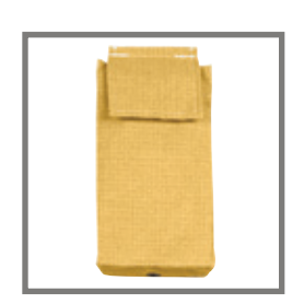
Radio pocket (Standard 8" x 4" x 2" or custom size)