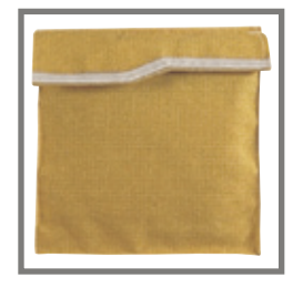
VizGrip<sup>™</sup> pocket flap