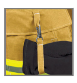
Clip and loop for gloves