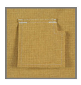
Flap with angle on right or left