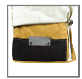
Life line rope pocket (inside hem of coat)