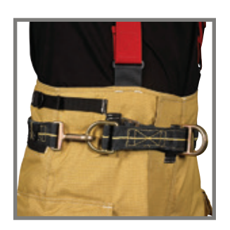
Gemtor<sup>™</sup> 544 FR