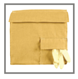
Exterior medical patch pocket (4" x 4") (Shell & neoprene)