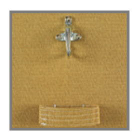
Riveted clip with Hook & Loop fastener