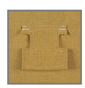
Flap with holes on right and/or left