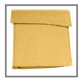
Semi bellow pockets (10" x 10" or 8" x 10") Available with reinforcements