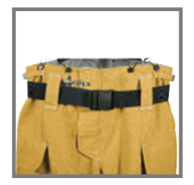
Kevlar® belt with belt loops