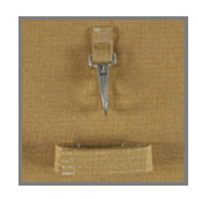
Clip with Hook & Loop fastener (SL-90)