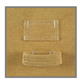
Tab with Hook & Loop fastener