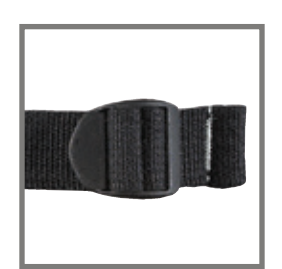
Two adjustment straps (black Nomex® webbing) with thermoplastic buckles