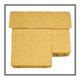
Combo wedge (3" x 8" x 2") and gloves (6.5" x 10" x 2") pocket with Kevlar® twill reinforcement