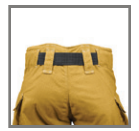
Kevlar® belt with tunnel and belt loops