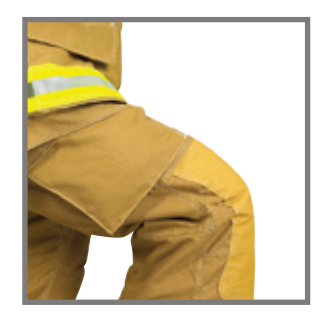
EMK™ (Enhanced Mobility Knee™)