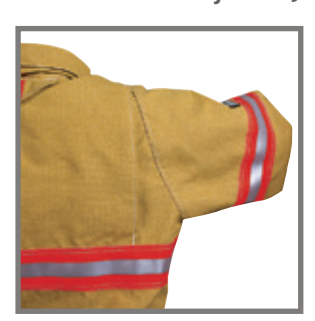
X-DESIGN™ FMA™ (Forward Motion Arm™ system)