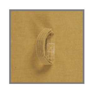
Fixed glove strap