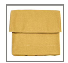
Fixed mask pocket (10" x 10" x 2.5" with Kevlar® twill reinforcement