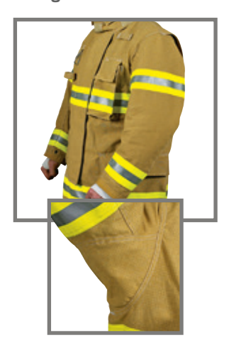
CLASSIC DESIGN™ Reach Flex™ system design